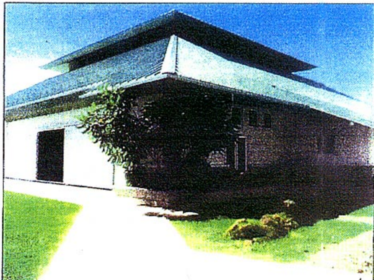
The Radha Soami Society Beas Canada, a non-denominational spiritual organization, owns this property off Sixth Line in Hornby where the group grows produce destined for various community and non-profit organizations in Halton. Members also provide food to Friendship House, an organization that assists various groups in the Kitchener-Waterloo area.

etables to her program. The food from the group's farm is sent to a number of schools in Halton including C. H. Norton Public School in Burlington, Tom Thomson Public School in Burlington, Sam Sherratt Public School in Milton, George Kennedy Public School in Georgetown, and St. Gabriel Catholic School in Burlington.